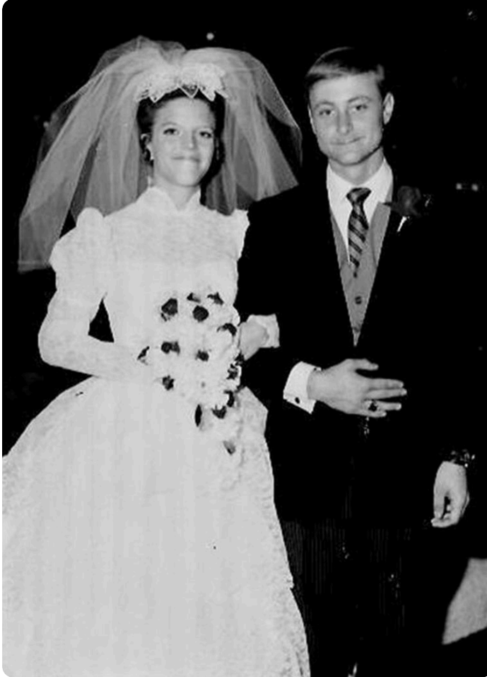
December 27, 1969. Young & in love to the end.